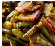
SLOW COOKER BARBECUED GREEN BEANS